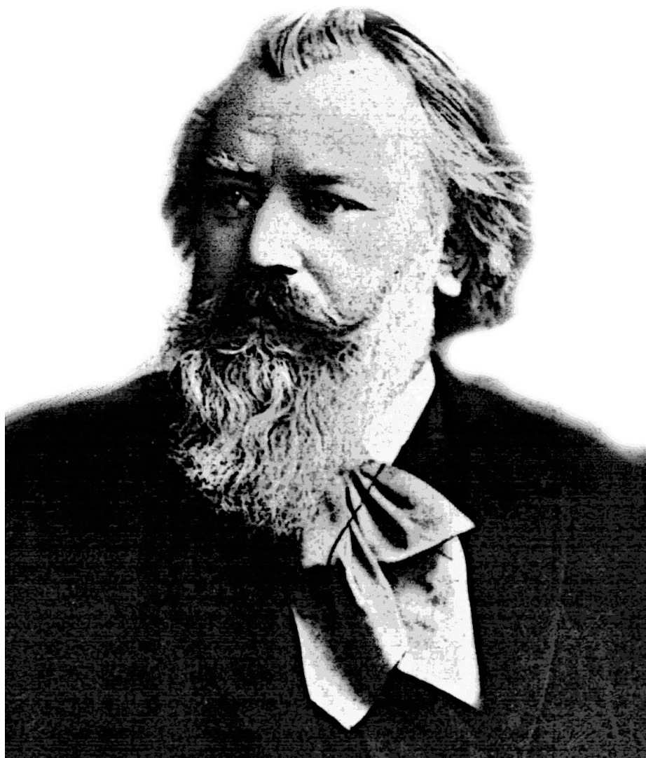
Johannes Brahms (1833-97)