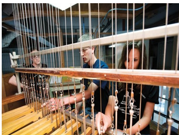
Students serenade the campus on a daily basis throughout the year.

LEARN, DISCOVER, HEAL, CREATE— AND MAKE THE WORLD EVER BETTER