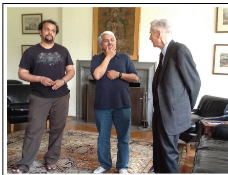
Tate at IAS, Princeton 03 May 2014.