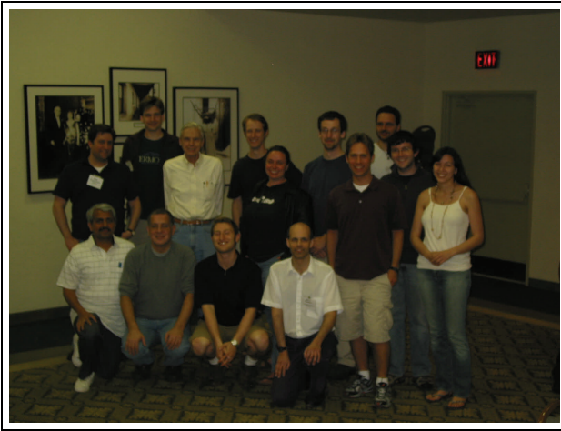
Tate with some of his mathematical descendants at Arizona winter school, 13 March 2007 (his birthday).

Lubin-Tate towers played an important role in the approach (e.g., by Harris and Taylor) to the local Langlands correspondence for GL_n , as well as in the earlier approach by Drinfeld to the Langlands correspondence for function fields.