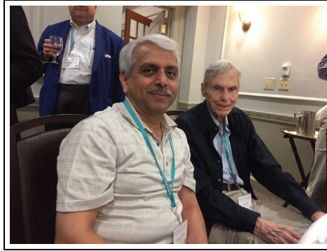
From Barry Mazur's 80th birthday conference at Harvard, June 2018.

connections of K -groups with extensions of motives have led to vast areas of mathematics studying the structures behind the arithmetic of the special values of zeta and L -functions.