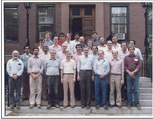
With students, Tate's 60th birthday conference.

For the uninitiated, class field theory is a well-developed theory, explaining special arithmetic aspects of algebraic number systems with commutative symmetry (Galois) groups. It is considered as a crowning achievement of algebraic number theory in the first half of the 20th century.