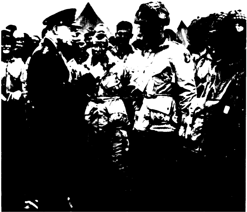
Gen. Dwight D. Eisenhower, supreme commander of Allied Expeditionary Forces, with U.S. paratroopers preparing for the D day invasion of France, June 6, 1944

The orders were simple and direct: "You will enter the continent of Europe and, in conjunction with the other United Nations, undertake operations aimed at the heart of Germany and the destruction of her armed forces."