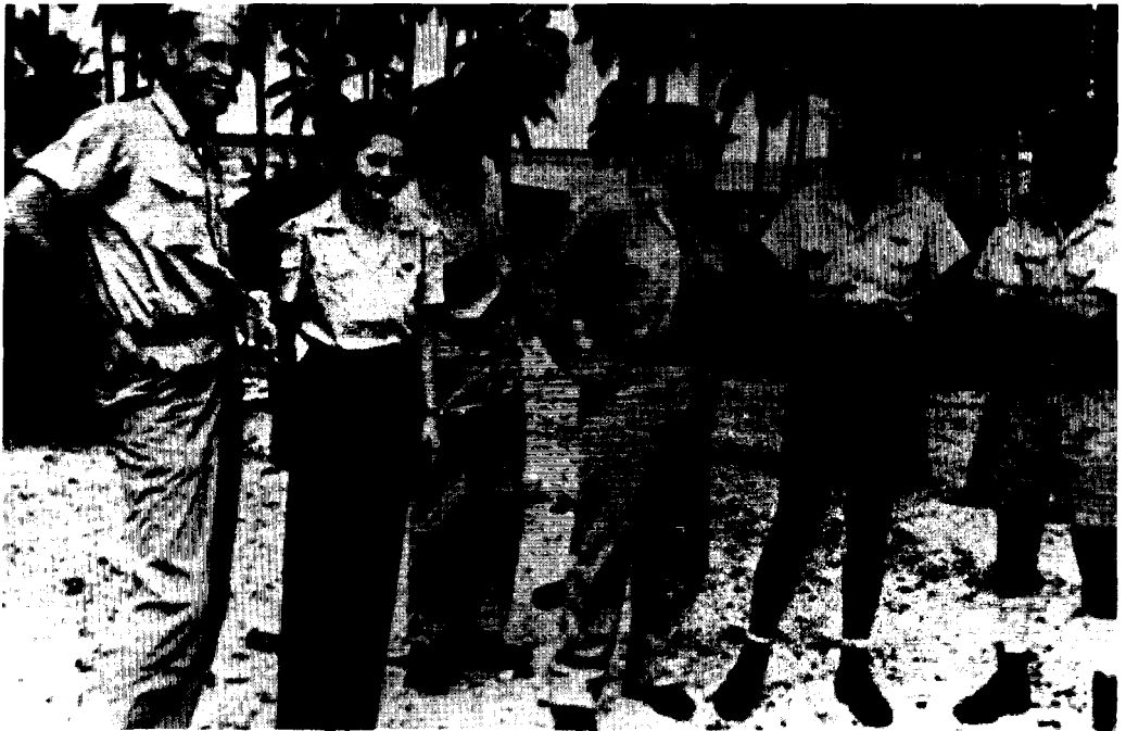
Lt. (jg) Richard M. Nixon (third from left), South Pacific, circa 1943

not fit for duty, Franklin Roosevelt gave Johnson a mission to the South Pacific as a "presidential inspector."