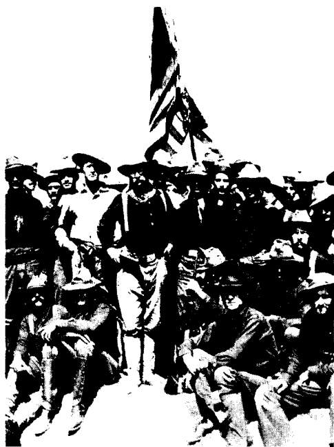
The "Rough Rider," Lt. Col. Theodore Roosevelt, posing with troops after the Battle of San Juan Hill, Cuba, July 1898

died on the same day in 1884, he left his native New York for life as a Dakota rancher. Although something of a "dude" rancher, his full-steam-ahead approach soon earned him the admiration of his cattle hands.