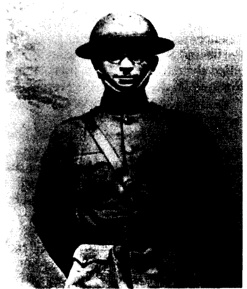
Harry S Truman during World War I

After temporary wartime promotions, Eisenhower reassumed his captain's rank on June 30, 1920. A few days later he was promoted to major, the rank he would hold for the next sixteen years. Though lacking sympathy for official Army tank doctrine, Eisenhower