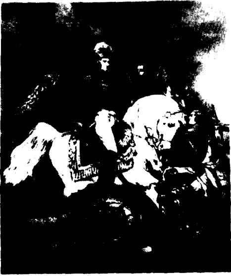
WILLIAM HENRY HARRISON BATTLE OF TIPPECANOE

Carrier lithograph of Gen. William Henry Harrison, hero of the Battle of Tippecanoe, prepared for Harrison's presidential campaign in 1840