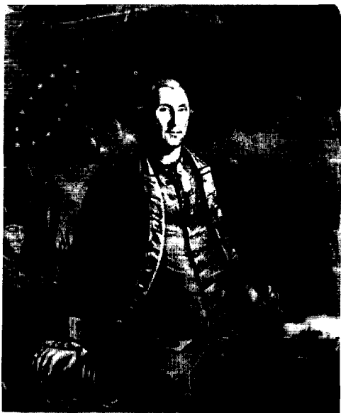
George Washington Mezzotint by Charles Willson Peale, 1780

Mezzotint of a portrait of Gen. George Washington by Charles Willson Peale, 1780