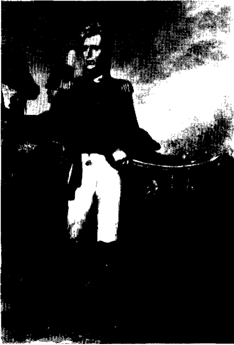
"Old Hickory," 1819 portrait of Gen. Andrew Jackson by John Vanderlyn (New York City Hall)