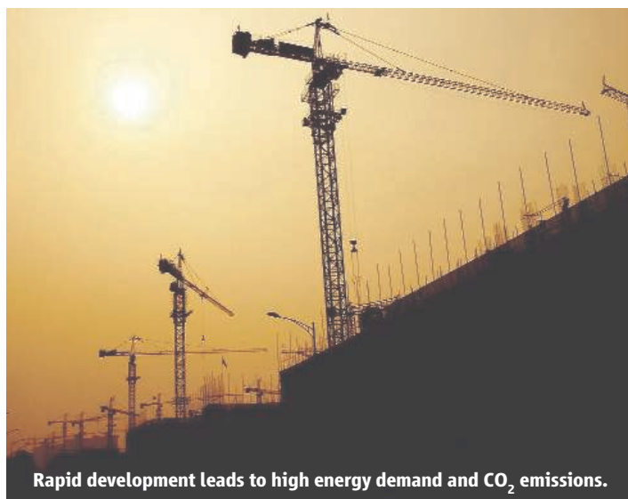
Rapid development leads to high energy demand and CO 2 emissions.

The rate of development of renewable energy in China is even faster than that of coal-fired power plants. The 2020 targets for hydroelectric, nuclear, biomass, wind, and solar power are 300, 40, 30, 30, and 1.8 GW,