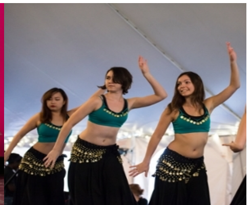
Royals Dance Team BPG