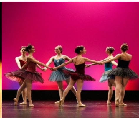
RICE Crew UR Celtic