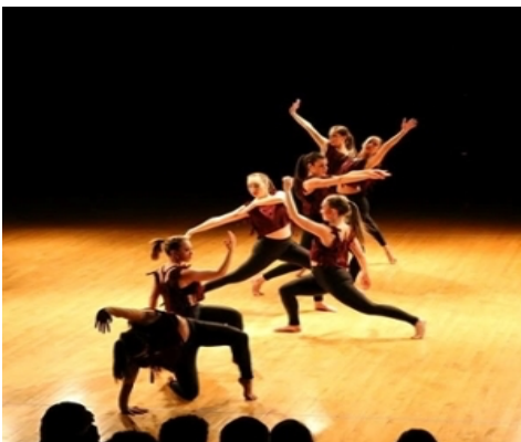
Bhangra Salseros Sihir Belly Dance Ensemble

Featuring UR's Student Dance Groups including: