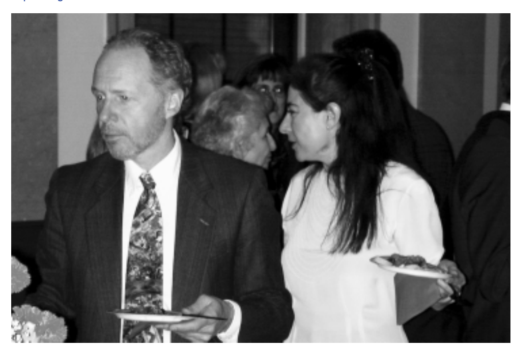
Captioning 8Captioning 1