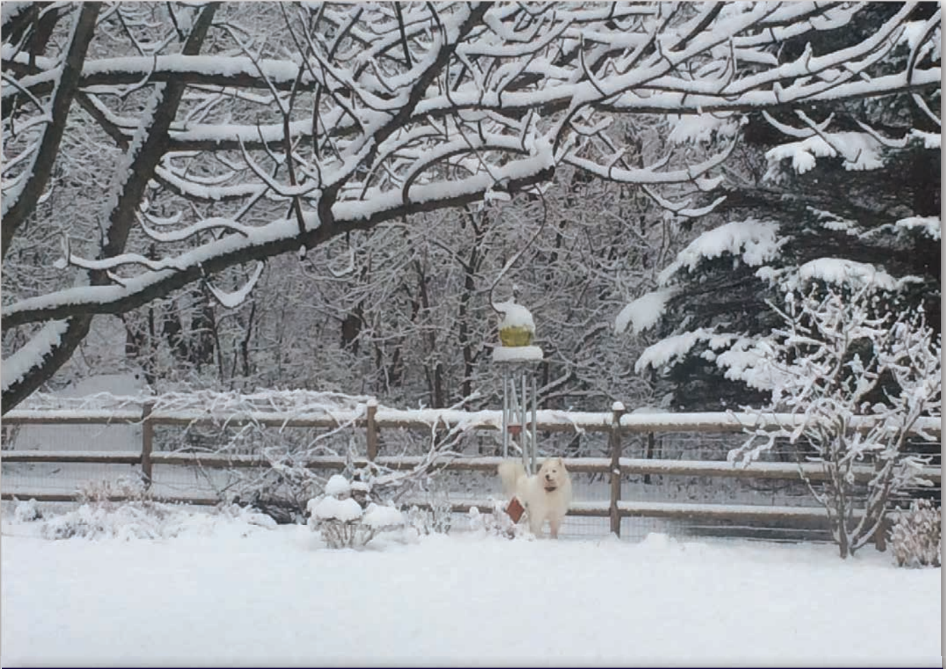
Maverick Benyajati looking for anything that moves...