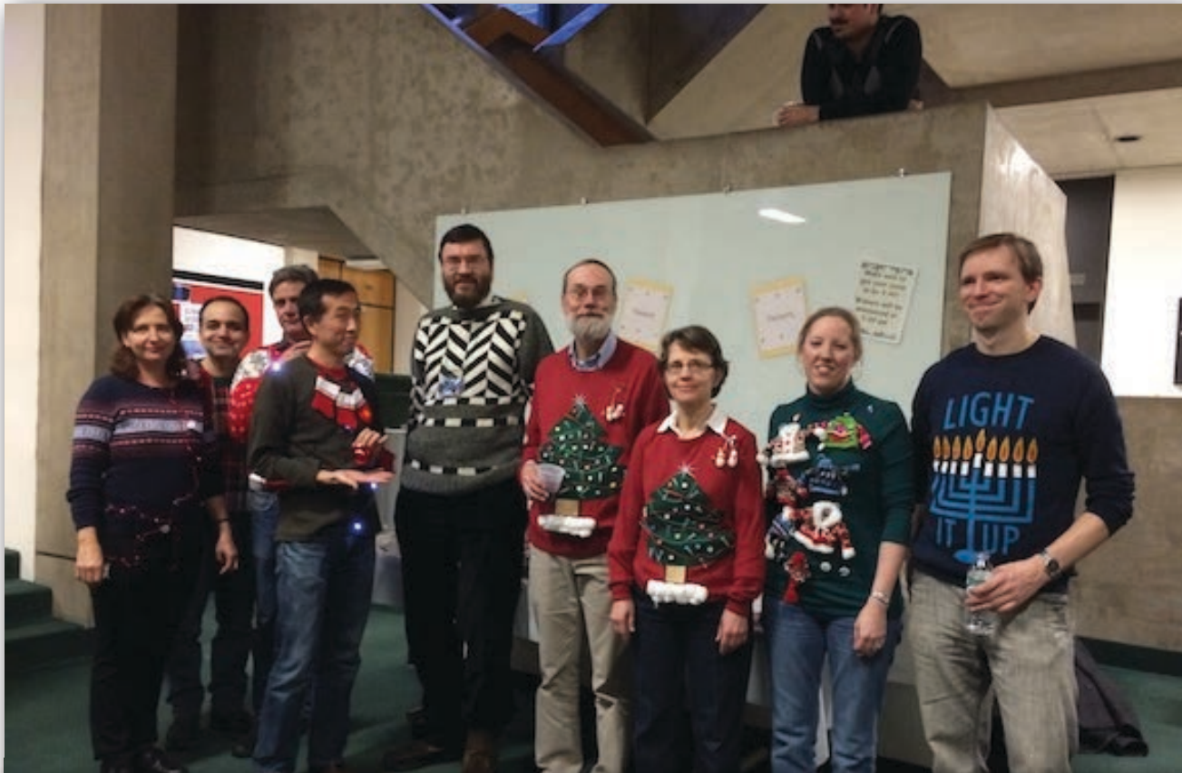
Bio Department Ugly Sweater Contest 12/15/14