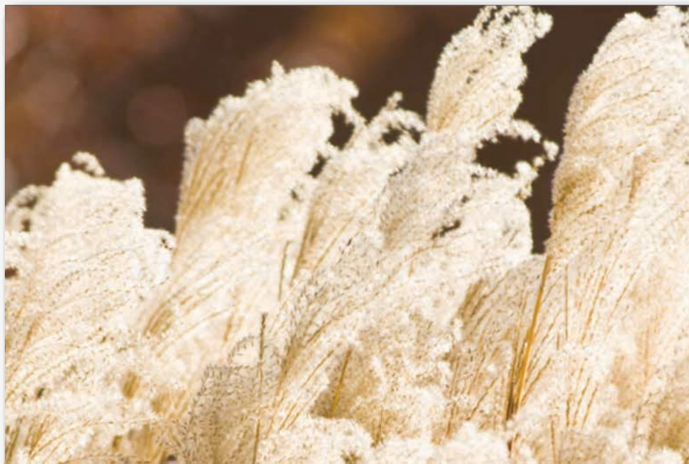
"Tall grass shines in the autumn sun on River campus"