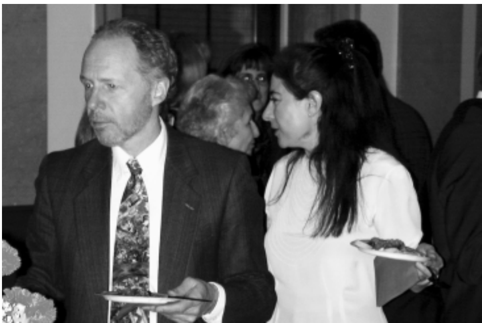
Captioning 8Captioning 1