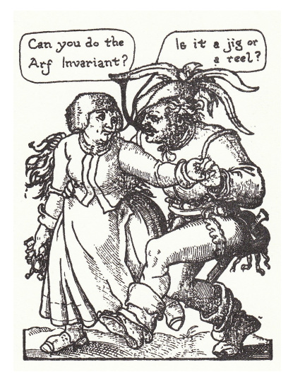
Drawing by Carolyn Snaith 1981 London, Ontario