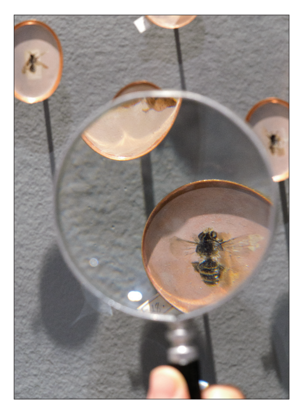
Pinpoints of Perception: Portraits of 1000 Native Bees Oil on copper, etched glass, and mixed-media