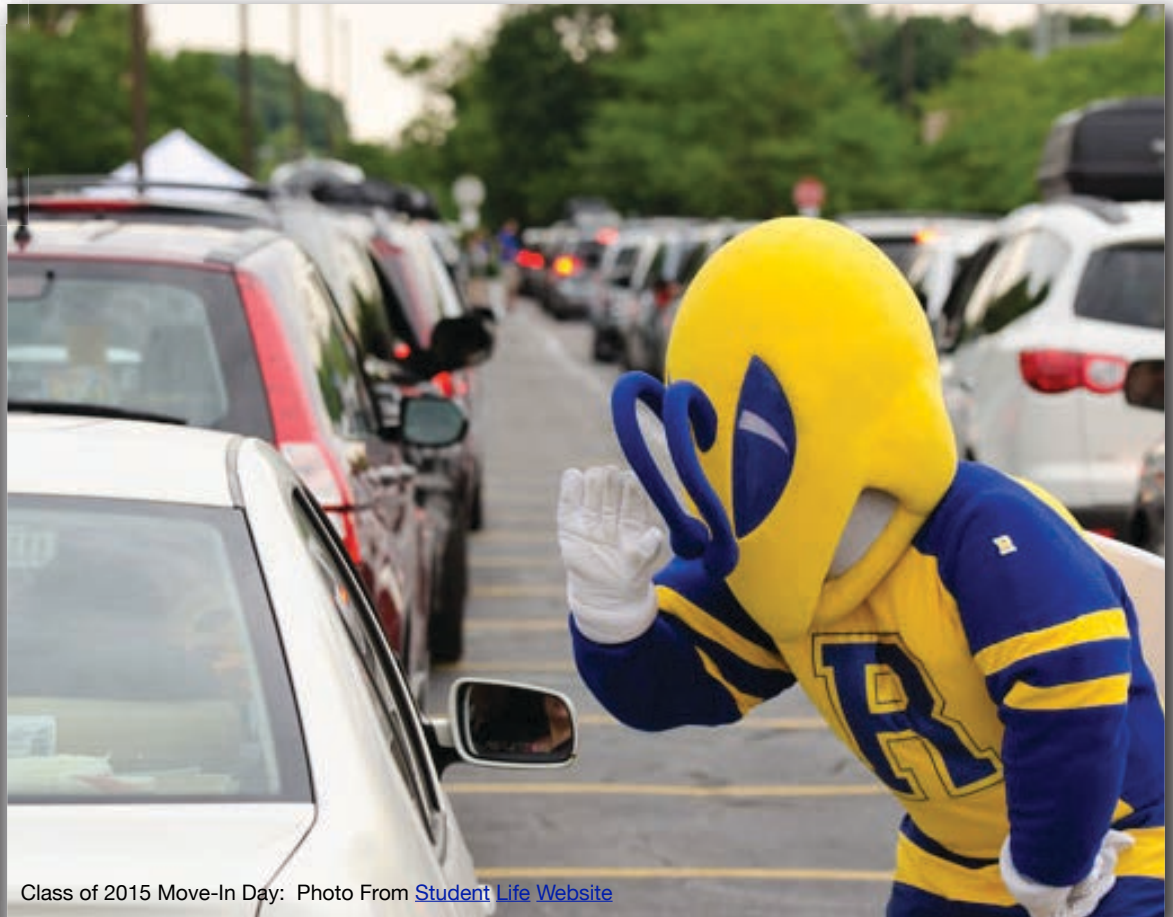
Class of 2015 Move-In Day: Photo From Student Life Website