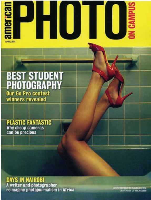
Self-portrait, Claire Cohen, American Photo On Campus , Vol. 15, No. 2, April 2011

Claire Cohen recently was the runner up in the Fine Art category of American Photo 's "Go Pro" contest and is featured on the cover of the American Photo On Campus April Issue. She is also featured on the contest's website http://popphoto.com/goprowinners .